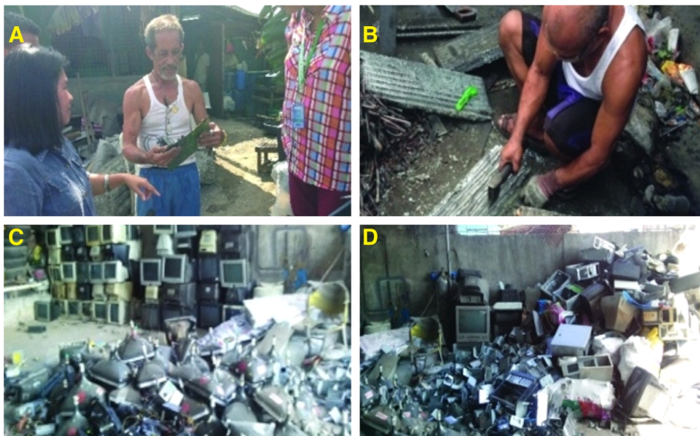
Fig. 3: Informal e-waste recyclers in Tondo (A and B) and e-waste dumpsites located in Tondo, Manila (C and D).

involved the gathering of information about the location of e-waste dumpsites. Data from these dumpsites were obtained by visiting dumpsites located in Metro Manila specifically, Tondo and Payatas. The second part of the study involved the identification of informal e-waste recyclers located at these dumpsites, which was done for Payatas location with the help of local contacts of Ban Toxics organization (Fig. 2), and for Tondo, with the assistance of the Sustainable Management Practices officials (Fig. 3). At both the locations, the access to the e-waste dumpsites and informal recyclers was made possible through the help of the Barangay (Local Municipal Body) chief. The appropriate ethical considerations involving human volunteers were followed. A questionnaire was prepared and, a detailed survey was conducted to gather information about the medical history, involvement with e-waste, health-related problems as well as the lifestyle of each participant.